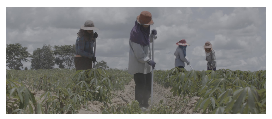
"My field was full of mines. I grew cassava in it before it was cleared and when I harvested my cassava I saw the mines. I was extremely scared. I didnt know if I would die or my children, husband or anyone else. After the mines were cleared I was so excited to walk in my field without fear. Now I feel safe."